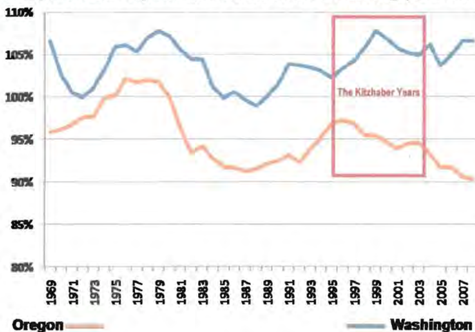
Insert OBC logo here Per Capita Income Expressed as a Share of the U.S. Average, 1969-2008

Despite inheriting a robust economy, Oregon's economy declined during John Kitzhaber's eight years as Governor. The state unemployment rate was 4.7 percent when he came into